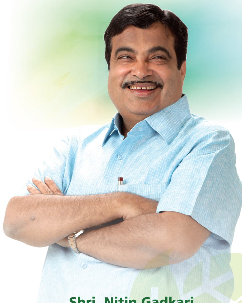
Shri. Nitin Gadkari

“Our farmers are the backbone of country’s economy. Development of the country is just impossible without the growth of farmers and farming Sector. Through Agrovision Foundation, we are committed to farmers education, encouraging newer methods of farming and allied activities to make livelihood of farmers sustainable and bringing new hope in their lives.”