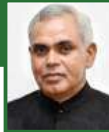
Shri. Acharya Devvrat Governor of Gujarat

"Agrovision is a platform for farmers to realise their dreams of sustainable and prosperous living through the adoption of modern knowledge, technology, information, and machinery. Agrovision is pursuing to facilitate various schemes and projects related to dairy, sugarcane, orange, fisheries, and organic farming. Farmers can not only become producers of grain but also that of energy, aviation fuel & even bitumen. I dream that they will be Urja Daata in addition of being Anna Daata...."