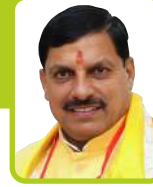
Dr Mohan Yadav Chief Minister, MP

The overwhelming response of farmers, that has kept growing every year, is a proof of Agrovision’s right direction and the change it is bringing in farmers’ lives. ”