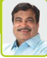
Shri. Nitin Gadkari Chief Patron, Agrovision

“ We are in the 15 th year of Agrovision. With every new edition of Agrovision, opportunities for the farmers of Vidarbha keep growing as the annual agriculture summit keeps imparting information and knowledge of the latest advancements, state of the art technologies and expanding market potential in agriculture field to the farmers.